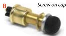
Screw on cap