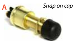
Snap on cap